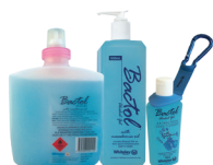
Pack Size: 80mL, carabiner, 500mL, 1L pod