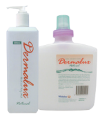
Pack Size: 500mL, 1L Pod