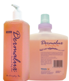
Pack Size: 500mL, 1L Pod