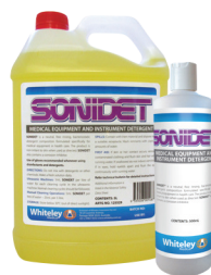
Pack Size: 5L, empty 500mL bottle