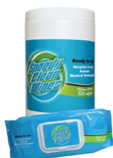
Pack Size: 100 Wipes (Canister), 50 Wipes (Flatpack)

Surface cleaning of benches, trolleys and equipment within the dental environment using neutral detergents assists in removing organic soil from contaminated surfaces.