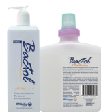
Pack Size: 500mL, 1L