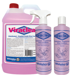
Pack Size: 5L, 500mL Trigger, 500mL Squeeze