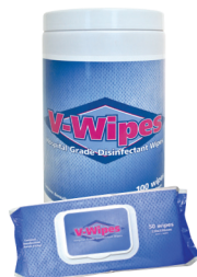
Pack Size: 100 Wipes (Canister), 50 Wipes (Flatpack)