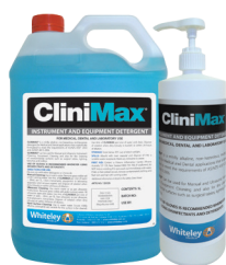
Pack Size: 5L, 1L

The instruments used in dentistry are often very delicate, expensive and the chemicals used to clean instruments need to be specially formulated to effectively clean and disinfect without harming the instruments or users. Whiteley Corporation has developed a range of instrument detergents and disinfectants specifically for use in Dentistry.